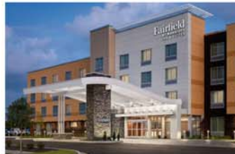
Fairfield Inn by Marriott