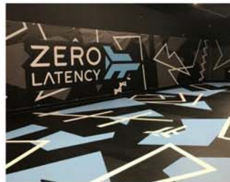
Zero Latency VR