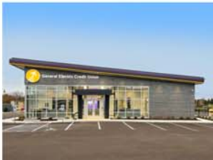
GE Credit Union