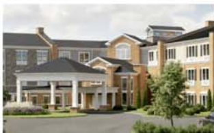
Provisions Senior Living