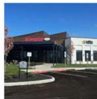
Telhio and Crimson Cup