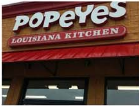
Popeye's Louisiana Kitchen