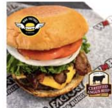
Wing & Burger Factory