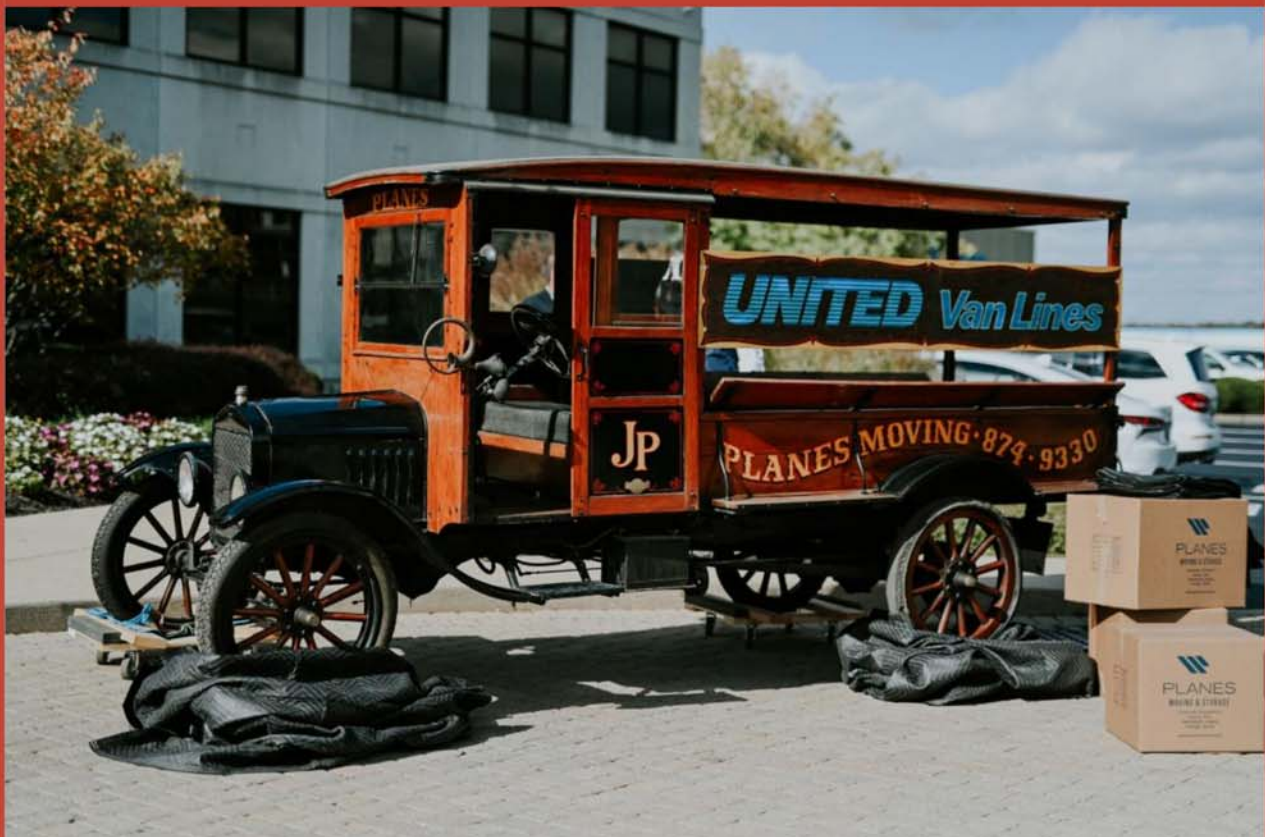
PLANES CELEBRATES 100 YEARS OF BUSINESS